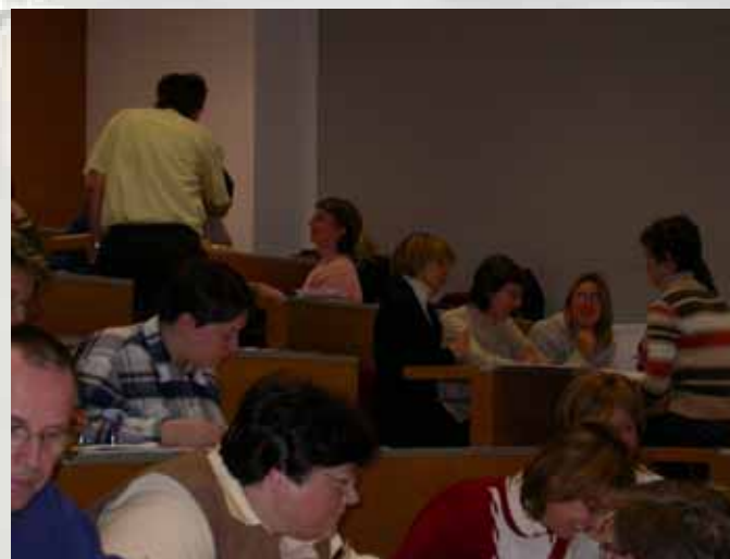
Practical exercise on measurement traceability, National Institute of Chemistry, Ljubljana, 2005.