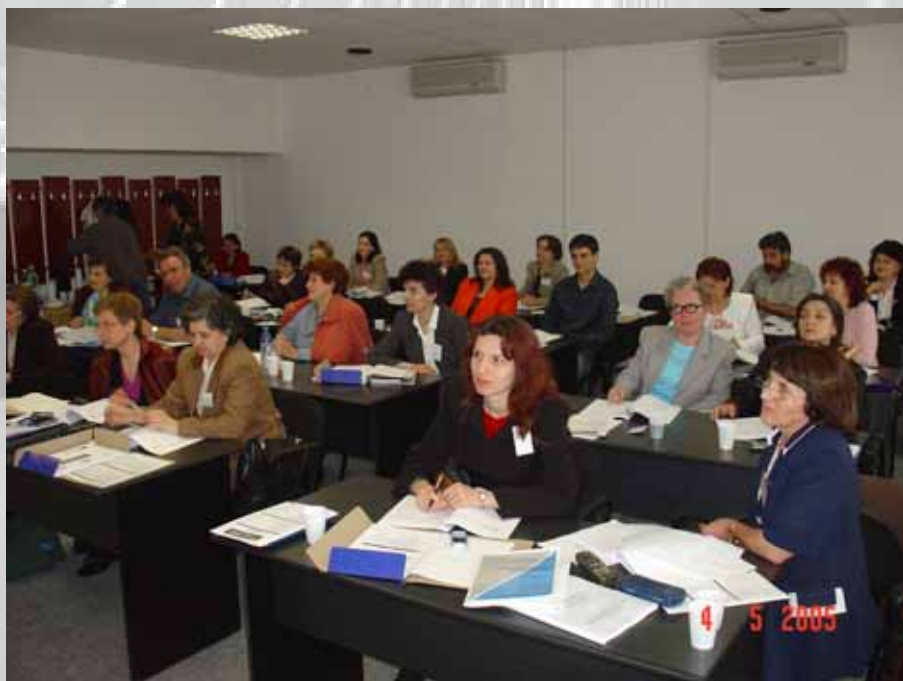
TrainMiC seminar at INM, Bucharest, May 2005.

This event offered also the opportunity to have a good interaction with representatives from environmental institutions, which expressed their interest to get some TrainMiC training dedicated to water laboratories.